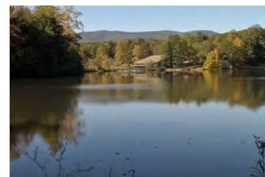
Scenes Around Sautee Nacoochee